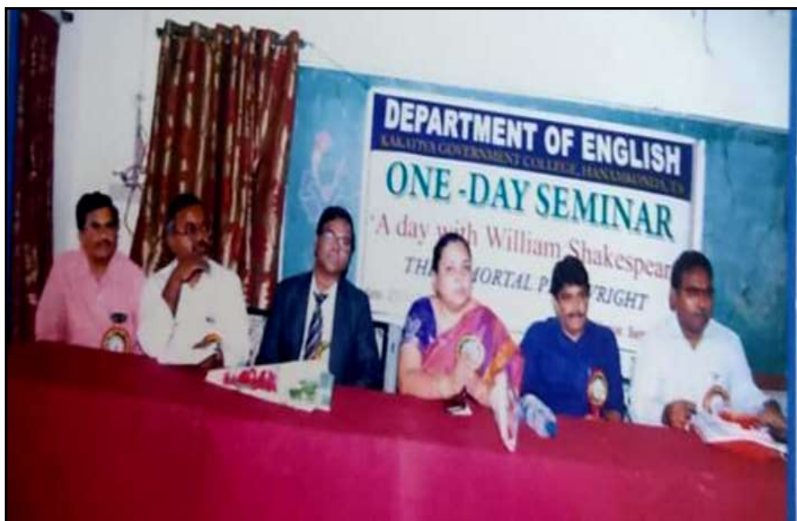
The dignitaries on the dias in the seminar on 22-04-2017